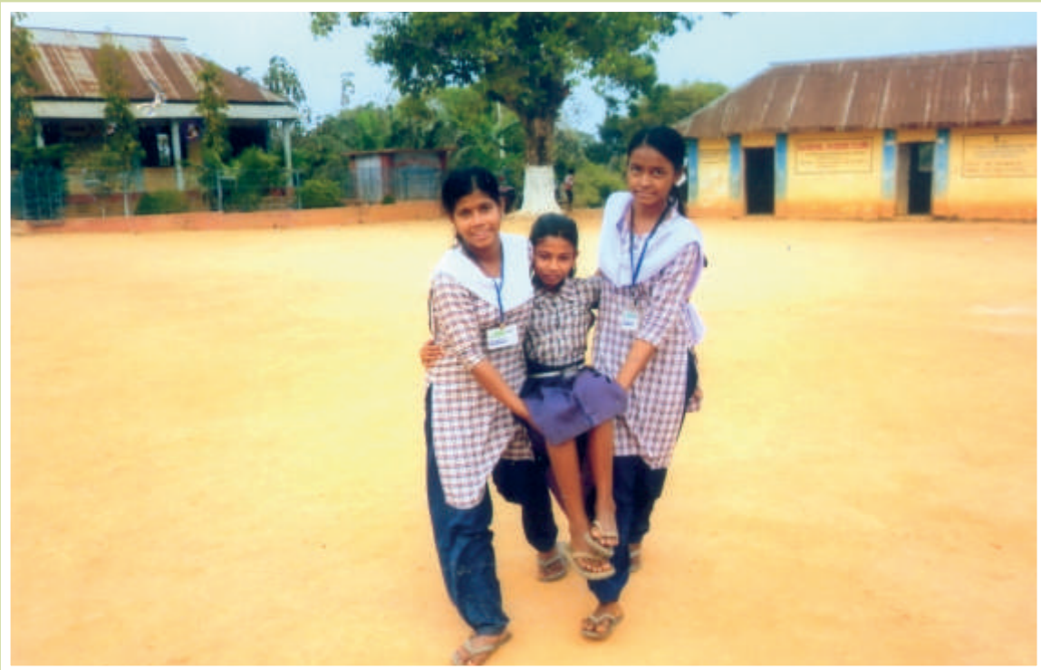
Capacity building of School Children on Disaster Risk Reduction under NSSP

NDMA's Newsletter • Vol 1 • Issue 2 • October-December 2015